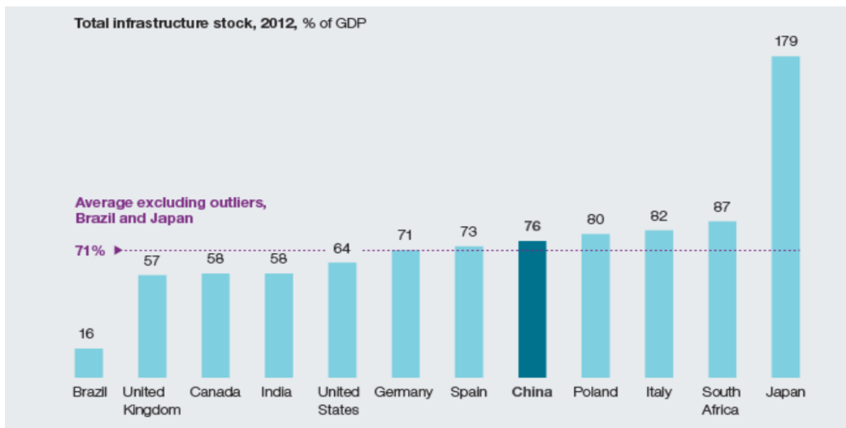
Figure 2. Comparing country spending as a percentage of GDP

The Covid-19 outbreak and uncertainty about post Brexit trade agreement posed a greater challenge on actualising a number of projects in the concept stage due to commence after 2021 Spending Review Period when unemployment and national debt is predicted to increase (BBC, 2020). The UK government focused heavily on infrastructure development as a way of levelling up and uniting the countries by investing about £4 billion on levelling up fund, £4.2 billion on