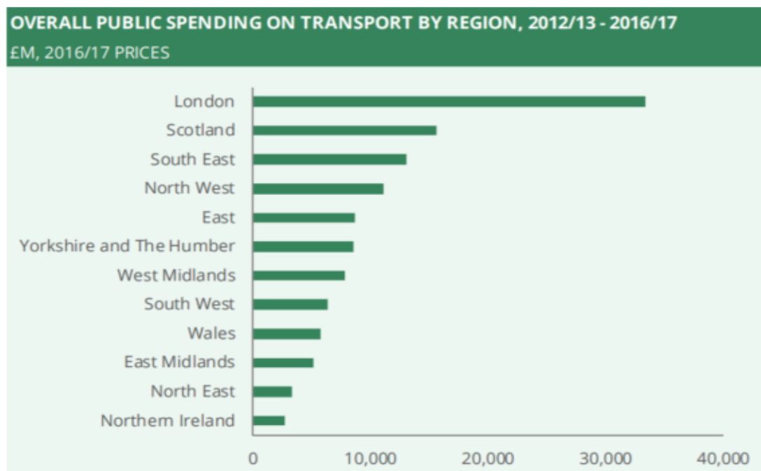
transport, equating to nearly £12billion. This transport system on a frequent basis. There is an Figure 4. Overall spending on transport by region 2012/13 to 2016/17